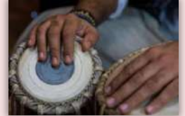
Tabla players use their fingers and palms to produce a wide range of sounds and expressions. Each stroke, or bol , has a specific name and technique associated with it.

The tabla is often used as a solo instrument as well as for accompaniment. It requires years of practice to master its complex rhythms and coordination. Renowned maestros have brought global recognition to this instrument. Today, the tabla continues to inspire musicians and audiences across the world.